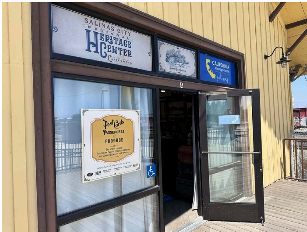
The California Welcome Center, along with the Salinas City Heritage Center are housed in the Southern Pacific Freight Depot building next to the Salinas train station at the Intermodal Transportation Center in Salinas.

The piece showcases the bureau's progress creating regional economic development programs through heritage tourism