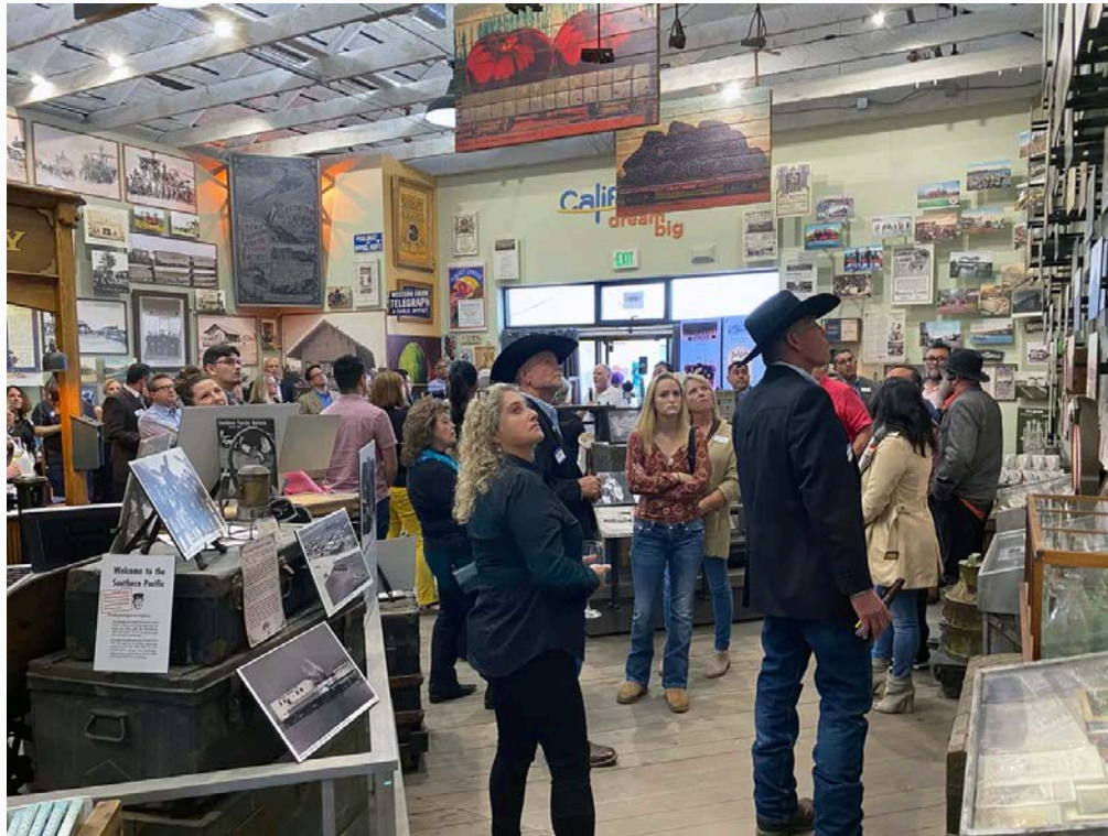
People take in the Heritage Museum exhibits during a 2022 event at the California Welcome Center inside the Southern Pacific freight depot, the oldest surviving commercial building in Salinas.