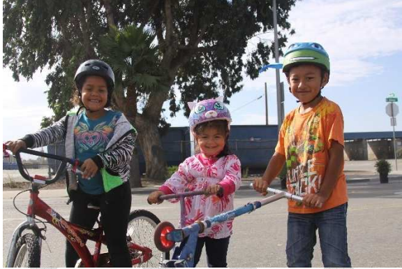
Children at the 2015 Ciclovía Salinas

Vision: Active transportation will be an integral, convenient and safe part of daily life in Monterey County for residents and visitors of all ages and abilities.