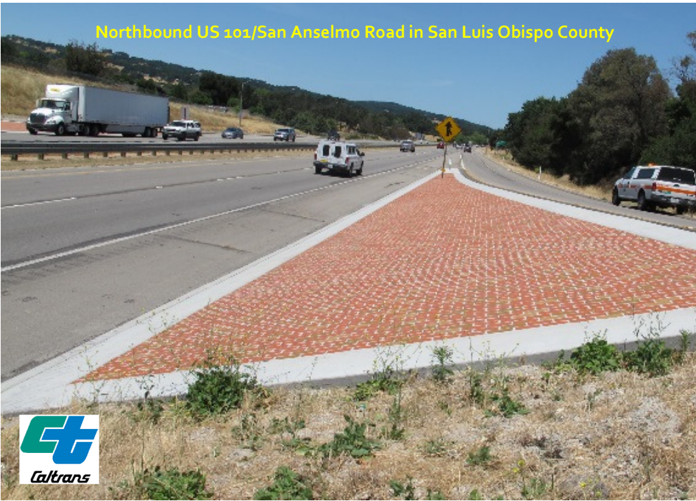
Northbound US 101/San Anselmo Road in San Luis Obispo County