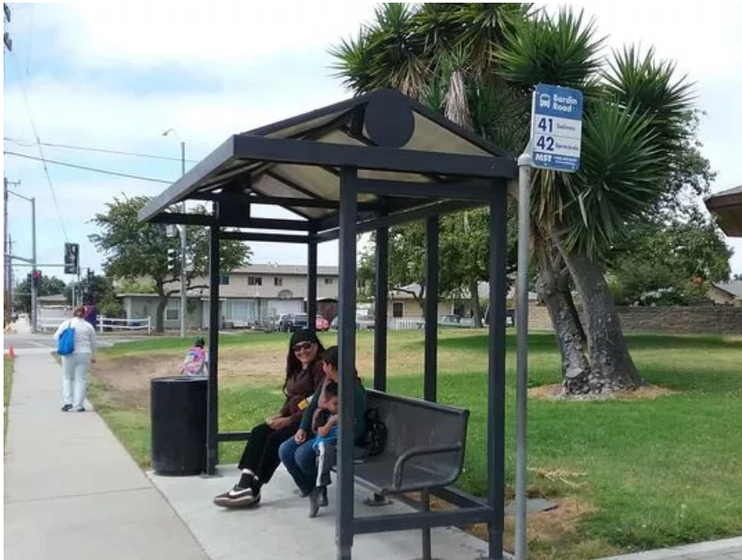
Waiting for Bus 41 at the Cesar Chavez Library in Salinas.