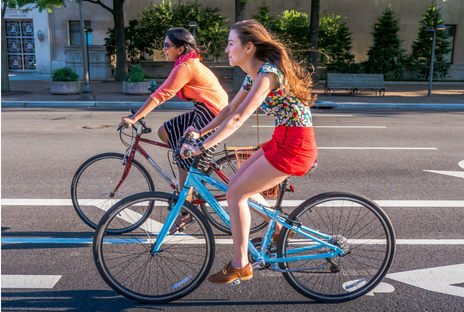
How stressful is this street to bike on? You can't tell from a photo.

Since its founding 50 years ago, the top U.S. agency for investigating transportation injuries had been surprisingly quiet about a phenomenon that's behind 30 percent of U.S. traffic fatalities.