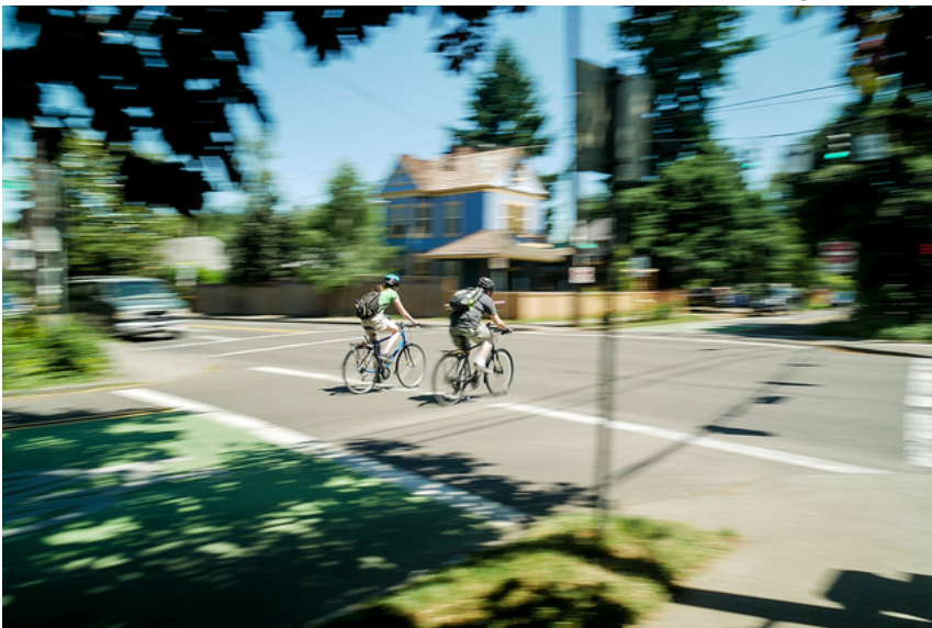
Neighborhood bikeways ( http://www.peopleforbikes.org/blog/entry/neighborhood-bikeways-are-hard-to-explain-here-are-26-free-photos-to-help ) make biking comfortable on side streets simply by slowing and reducing auto traffic.

What can biking believers inside and outside of government do to reduce dangerously fast driving?