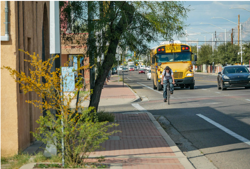
Bike lanes like this one might be quite comfortable on a low-speed street. In this case, not so much.

Most of the NTSB report combines recent data and long-term trends to show how many fatal collisions are caused by excessive auto speed. Speed-related death, for example, is "comparable to that attributed to alcohol-impaired driving."