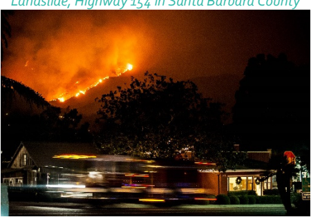
Thomas Fire, Highway 192 in Santa Barbara County