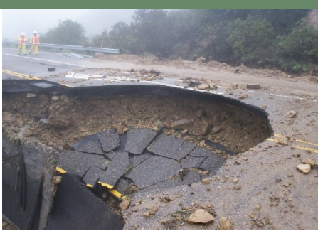
Landslide, Highway 154 in Santa Barbara County

District 5 recently kicked off its first climate change vulnerability assessment. The study will identify specific locations for likely impacts of rising sea levels, increasing storm and wildfires, coastal erosion, changing precipitation patterns and higher temperatures. The report will feature a GIS database with online interactive mapping for public use. Caltrans will evaluate other modal vulnerabilities with local partners. Agency partners include: California Department of Water Resources, California Energy Commission, California Geological Survey, Federal Emergency Management Agency, UC-Berkeley, UC-Davis and the U.S. Army Corps of Engineers. Caltrans is producing assessments for each District. District 5's report is scheduled for completion in fall 2019. http://www.dot.ca.gov/transplanning/ocp/vulnerabilit <u>y -assessment.html</u>