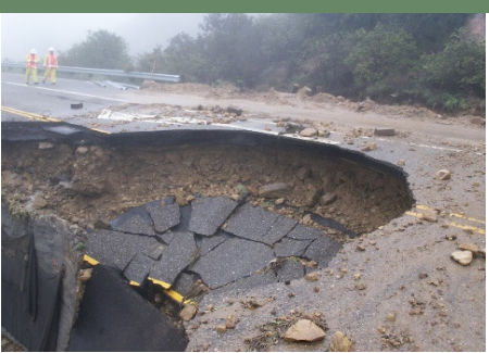
Landslide, Highway 154 in Santa Barbara County

District 5 recently kicked off its first climate change vulnerability assessment. The study will identify specific locations for likely impacts of rising sea levels, increasing storm and wildfires, coastal erosion, changing precipitation patterns and higher temperatures. The report will feature a GIS database with online interactive mapping for public use. Caltrans will evaluate other modal vulnerabilities with local partners. Agency partners include: California Department of California Water Resources, Energy Commission, California Geological Survey, Federal Emergency Management Agency, UC-Berkeley, UC-Davis and the U.S. Army Corps of Engineers. Caltrans is producing assessments for each District. District 5's report is scheduled for completion in fall 2019. http://www.dot.ca.gov/transplanning/ocp/vulnerabilit y -assessment.html