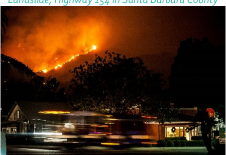
Thomas Fire, Highway 192 in Santa Barbara County