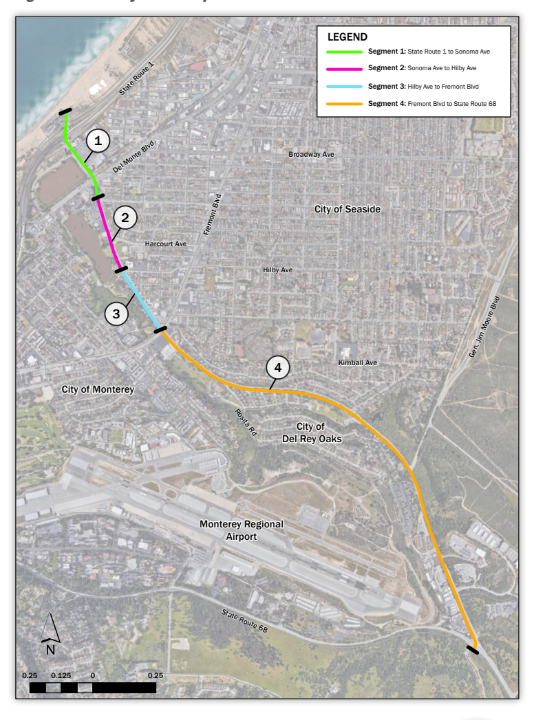
Figure E -1 Study Area Map