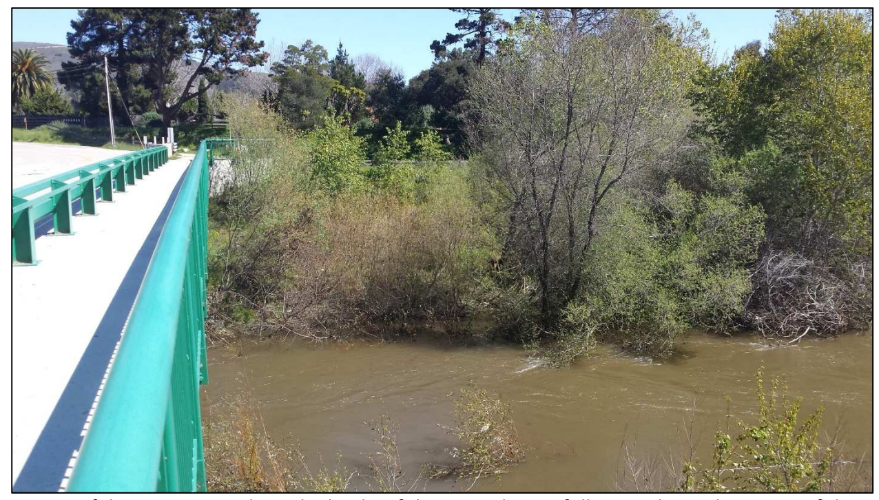
Successful revegetation along the banks of the Carmel River following the replacement of the Schulte Road Bridge.

The project replaced a 54-yeard old, one lane bridge on Schulte Road over the Carmel River. The old bridge did not meet Caltrans seismic, structural, and geometric standards nor meet current American Association of Safety and Highway Transportation Officials (AASHTO) geometric standards for rural roadways. The project was built over two construction seasons given the limited construction-time window dictated by the regulatory agencies to protect the sensitive habitant and wildlife in the area. The project was primarily funded by FHWA HBP (88.53%) and Measure X provided local matching funds and the funds to complete the revegetation monitoring and reporting to the regulatory agencies.