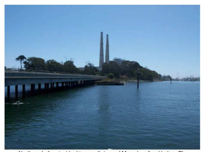
North end of project looking south toward Moss Landing Harbor. The Elkhorn Slough Bike Bridge will span Elkhorn Slough parallel to the existing State Route 1 Bridge. The Elkhorn Slough Bike Bridge will include rest area to stop and enjoy the scenery.