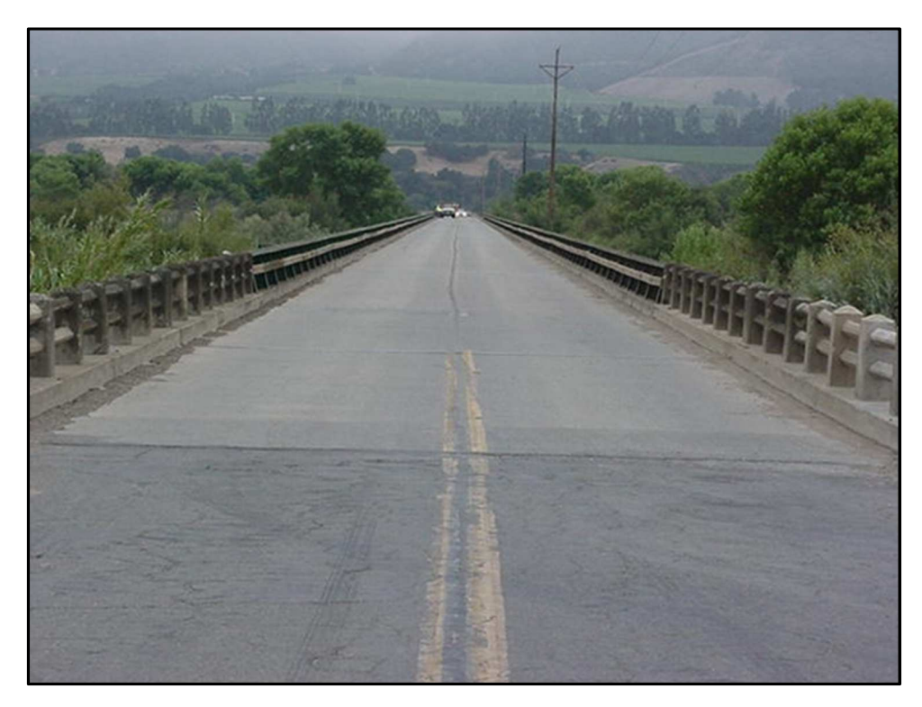
Existing Gonzales River Road bridge

The project is funded by FHWA HBMP (88.53%) and Measure X provided the local match (11.47%). The project is in the preliminary engineering and environmental documentation phase. This phase is expected to be completed next fiscal year.