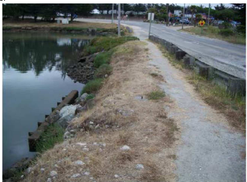
At the southern limit of the Moss Landing Segment the trail will be located between Moss Landing Harbor and Moss Landing Road.

The project proposes to construct a Class 1 bike/ped path along State Route One between Moss Landing Road and the North Harbor of Moss Landing. As part of the project a new 386-foot long bridge, parallel to the State Highway One bridge, will be constructed to cross the Elkhorn Slough. The project in in the right-of-way and permitting phase. The Project is funded by a variety of Federal, State and Local funds. The Measure X contribute to the local match for federal grants.