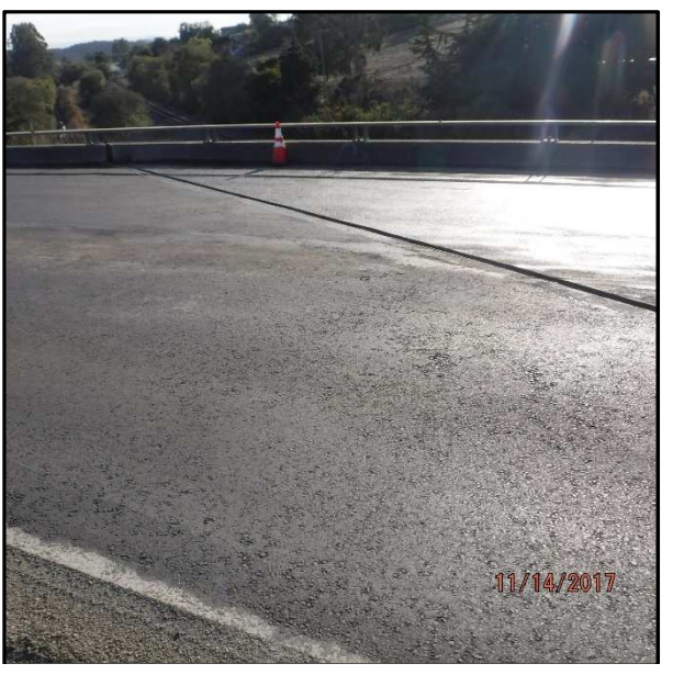
Elkhorn Road Bridge Approach and bridge deck Rehabilitation