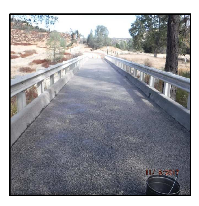
Before and after the rehabilitation of Big Sandy Road bridge deck