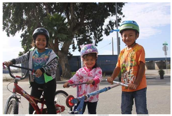
Children at the 2015 Ciclovia Salinas

Vision: Active transportation will be an integral, convenient and safe part of daily life in Monterey County for residents and visitors of all ages and abilities.