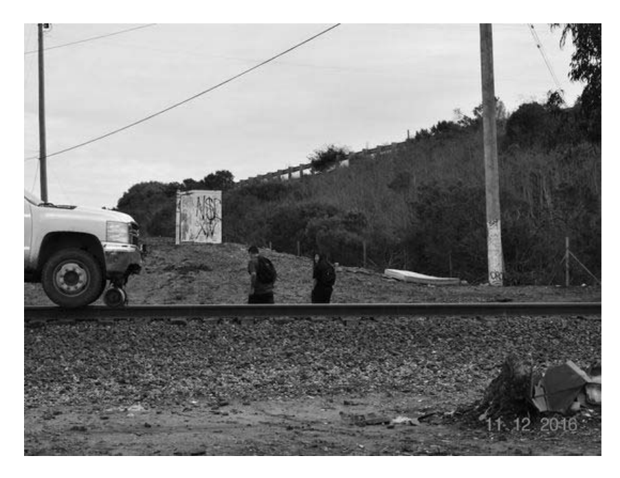
Students on their way to North Monterey County High School in Castroville walk through open fields and cross railroad tracks and a busy boulevard to get to campus.

Next, the task will be to get more students to walk and bike to school.